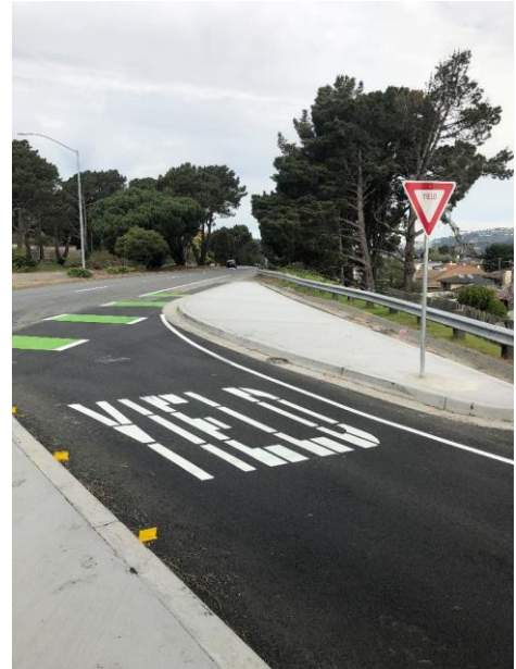
Junipero Serra Blvd at King Drive Intersection Improvements

CSG has also provided building plan review, building inspection, fire plan review, fire inspection, IT support, and code enforcement services to the City over the past 26 years.