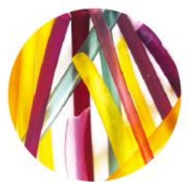
BY LOLIWARE Seaweed

Kickstarter.com/ projects/1530128773/ lolistraw-by-loliware