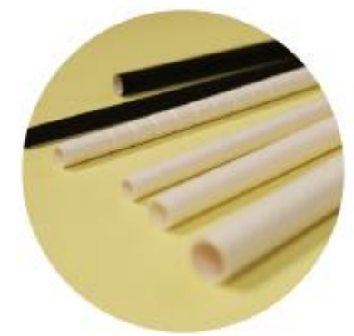
AARDVARK Paper straws Aardvarkstraws.com