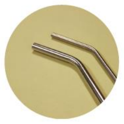
STEELYS DRINKWARE Stainless Steel SteelysDrinkware.com