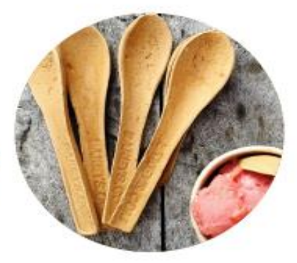
BAKEY'S EDIBLE CUTLERY Flours of jowar (sorghum), rice, and wheat Bakeys.com

Wheat bran and corn starch or sugarcane <u>VerifoodUS.com</u>