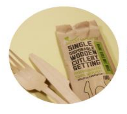
LEAFWARE Birchwood Leafware.com