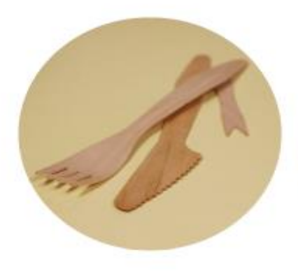
NATURAL TABLEWARE Aspen Wood NaturalTableware.com