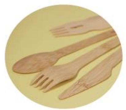
BAMBU Bamboo BambuHome.com