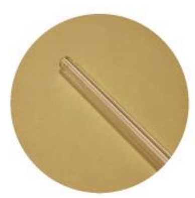
SIMPLY STRAWS Glass SimplyStraws.co