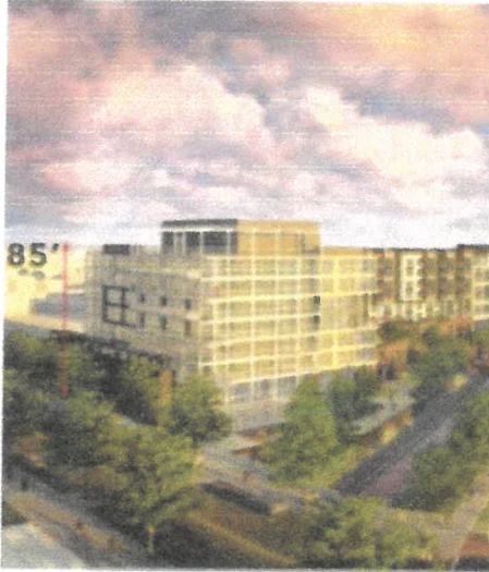
8 STORIES - FOR RENT 88 UNITS (18 AFFORDABLE AT MODERATE LEVEL)