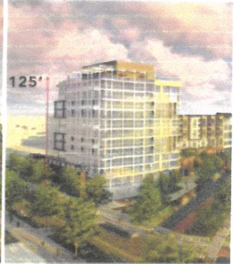
12 STORIES - FOR SALE 118 UNITS

We, the undersigned, residents of South San Francisco, oppose any development on the former PUC site in the Chestnut/El Camino corridor extending to Old Mission Road that exceeds three stories in height.