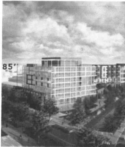
8 STORIES - FOR RENT 88 UNITS (18 AFFORDABLE AT MODERATE LEVEL)