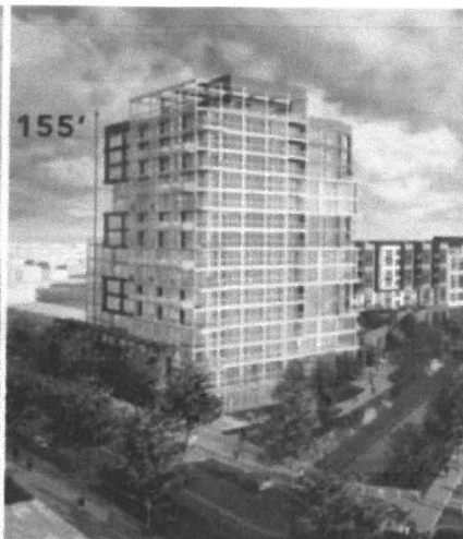
15 STORIES - FOR SALE 145 UNITS