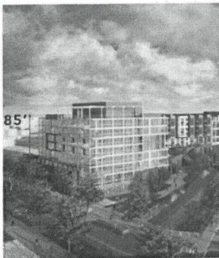
8 STORIES - FOR RENT 88 UNITS (18 AFFORDABLE AT MODERATE LEVEL)