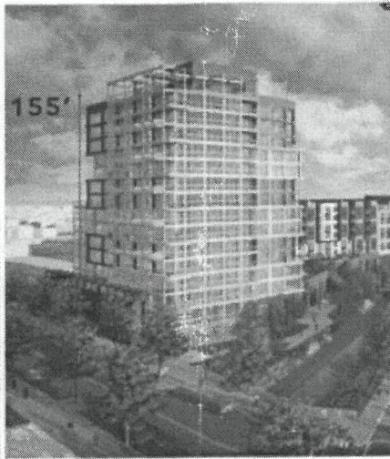
15 STORIES - FOR SALE 145 UNITS