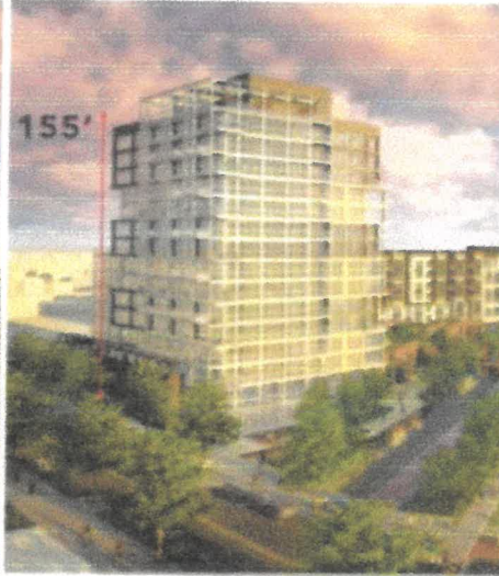
15 STORIES - FOR SALE 145 UNITS