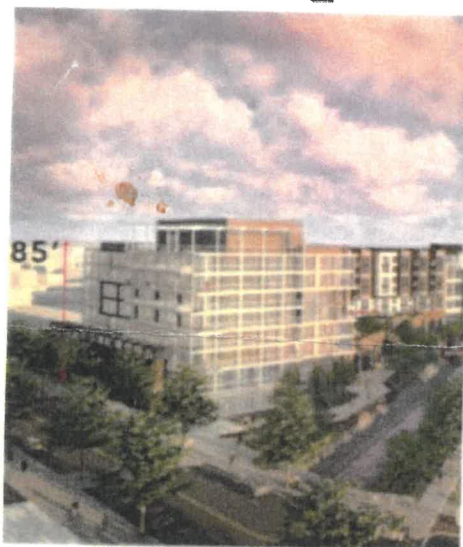
8 STORIES - FOR RENT 88 UNITS (18 AFFORDABLE AT MODERATE LEVEL)