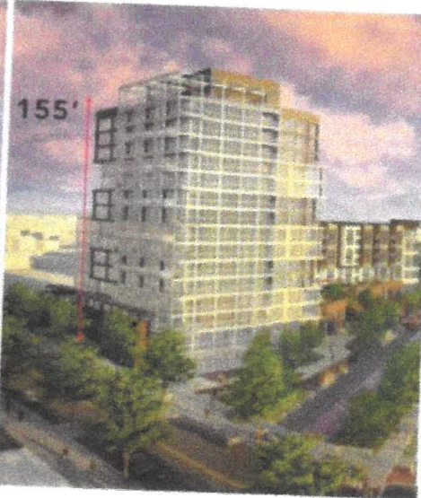
15 STORIES - FOR SALE 145 UNITS