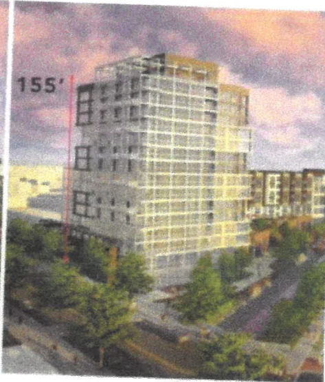
15 STORIES - FOR SALE 145 UNITS