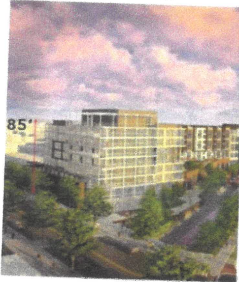
6 STORIES - FOR RENT 88 UNITS (18 AFFORDABLE AT MODERATE LEVEL)