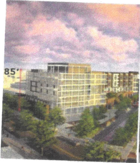
8 STORIES - FOR RENT 88 UNITS (18 AFFORDABLE AT MODERATE LEVEL)