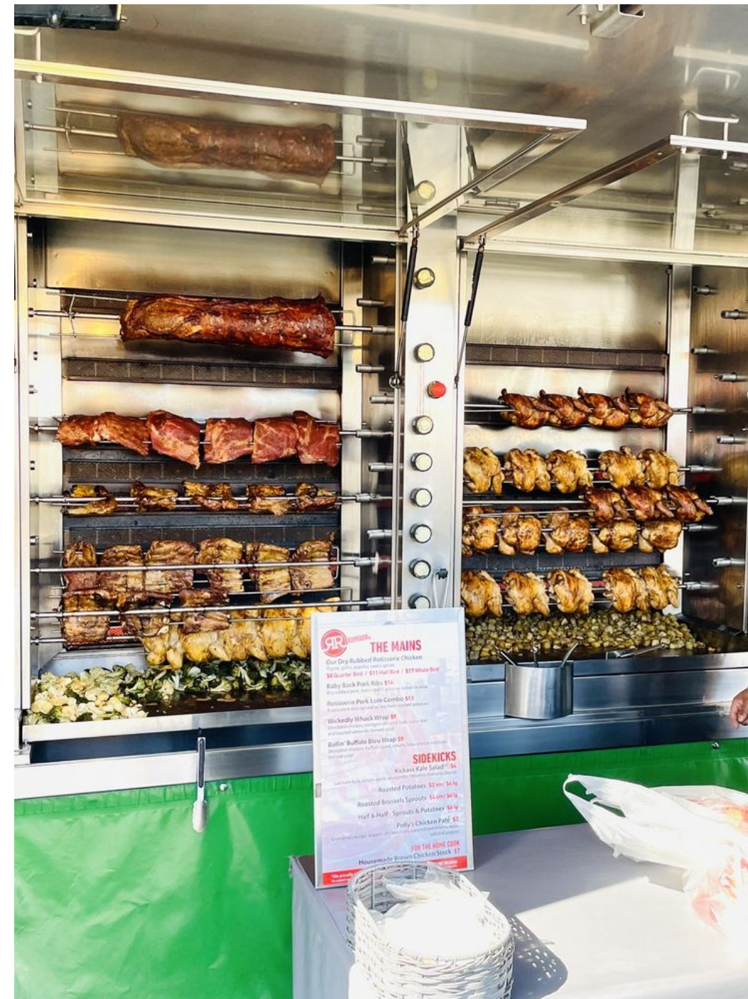
Roadside Rotisserie Chicken