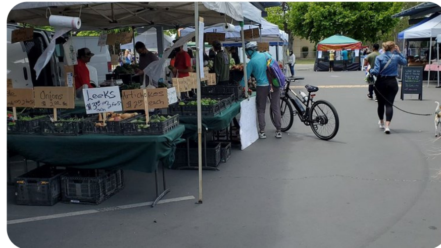
Rose Garden, San Jose