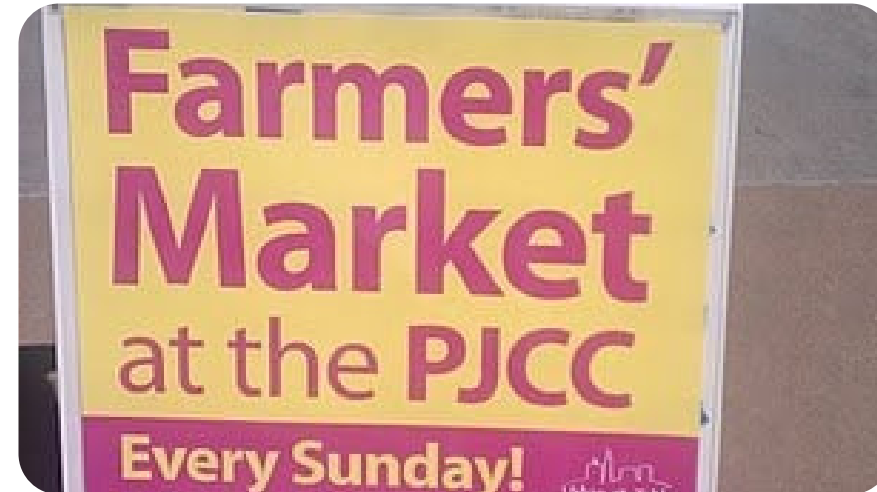
Peninsula Jewish Community Center