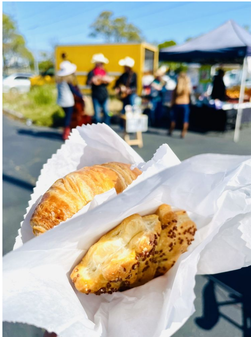
Made Out of Dough