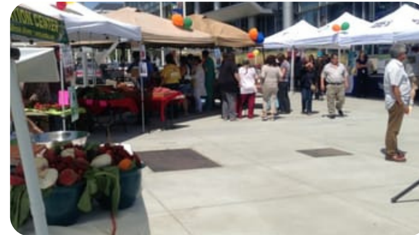
Santa Clara Valley Medical Center