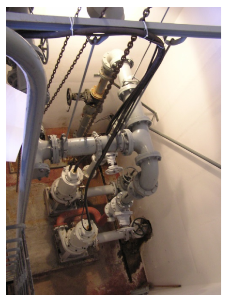
Figure 1: Original Pump Station #1 prior to relocation

trunk lines, interceptors, force mains and sewage pump stations serving commercial and industrial tributaries east of U.S. Highway 101 as ordered by the RWQCB in a Cease-and-Desist Order.