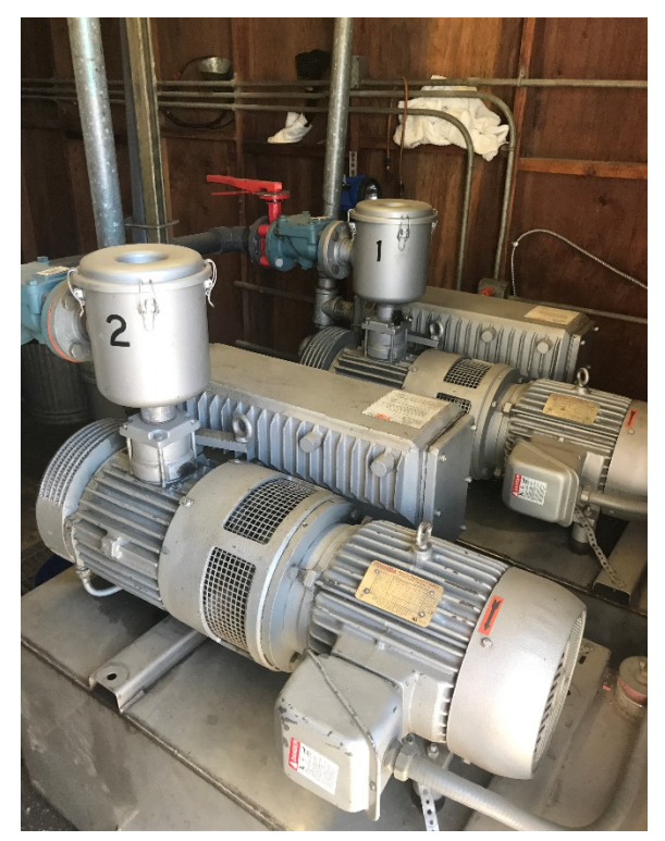
Figure 1 Existing vacuum pumps located within the pump house.

We understand that the City of South San Francisco is requesting proposals to relocate the vacuum/ejector pump station and the electrical switch gear cabinet at the Oyster Point Marina. The marina is being redeveloped to improve the public infrastructure, improve public access. address sea level rise and add new buildings, including a biotechnology campus and a 350-room hotel. The existing pump station and switch gear are currently located within the future buildout alignment of Marina Blvd, several feet lower than the projected future sea-level rise elevations. In addition, they are in conflict with the future hotel access at the eastern edge of the hotel parcel. The City would like to relocate the pump station and the switchgear cabinet prior to the commencement of hotel construction in mid-June 2025.