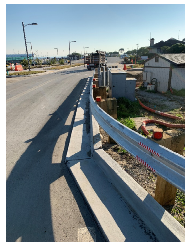
Figure 3 Existing switchgear in the center with the vacuum/ejector pump station on the right. The realigned Marina Blvd. is to the left, roughly 4 to 5-feet higher in elevation.

In addition to relocating and reconstructing the pump station, the adjacent electrical switchgear will also need to be moved. Much like the pump station, this switchgear serves the entire Oyster Point Marina east of Harbor Master Road. This includes powering lights, irrigation, the Harbor Master Building, the Yacht Club, restrooms, live-aboard docks and other marina facilities. The existing configuration includes PG&E joint trench in Marina Blvd. to a transformer located across the street from the switchgear. The power runs from the transformer to an adjacent PG&E cabinet, where it is metered. The power then runs across the road in conduit to the switchgear cabinet, where it is distributed to the existing facilities throughout the east basin. The new switchgear will be moved to a location chosen by the City.