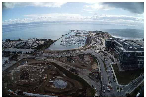
Figure 3: Aerial image of Oyster Point Phase IC improvements.

For the project, Langan performed numerous studies to evaluate the existing landfill, clay cap, and underlying subsurface conditions. Through these investigations, Langan made recommendations for excavations, clay cap installation, clay cap tie-ins and other details needed for the landfill waste relocation. Wilsev Ham incorporated these recommendations into the construction document set that was bid. Before construction began and with input from Wilsey Ham., Langan prepared a Landfill Post-Closure Development Plan to meet the requirements of Title 27 CCR landfill post-closure development standards. This plan needed to be approved prior to construction began, and provided a blue print for the policies and procedures the contractor needed to follow. During construction, Langan oversaw regrading of the landfill on behalf of the City, preparing reports for submission to the San Mateo County Environmental Health Services (SMECS) and Regional Water Quality Control Board (RWQCB) for approval. At the completion of the project, Wilsey Ham prepared as-built drawings showing that the critical aspects of the landfill closure plan. such as the thickness of the clay cap, were installed appropriately. These record