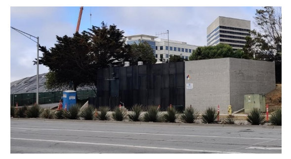
Figure 2: Pump Station No. 2 after completion of construction.

the landowner. An agreement was made where the easements were granted in exchange for architectural improvements to the station that better fit with the surrounding architecture that was being constructed. Our team coordinated with the landowner's architect and landscape architect to incorporate the façade improvements into the bid documents.