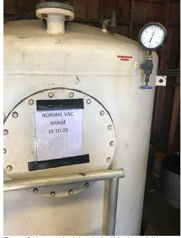
Figure 2 Vacuum tank located within the existing pump house.

The existing sewer collection system for the east basin of the Ovster Point Marina consists of a series of vacuum pipes servicing each of the facilities to the east of the Harbor Master Road, including the Harbor Master Building. The vacuum pipes, installed in the early 1980's, are connected to two vacuum pumps and a vacuum tank located within the existing pump station. When activated, the vacuum pumps and tank create a negative pressure within the vacuum pipes, drawing sanitary sewer wastewater from each of the aforementioned facilities and discharging the effluent into a wet well located within the pump house. Two additional ejector pumps located within the wet well turn on periodically to discharge the wastewater to a City maintained sewer pump to the west.