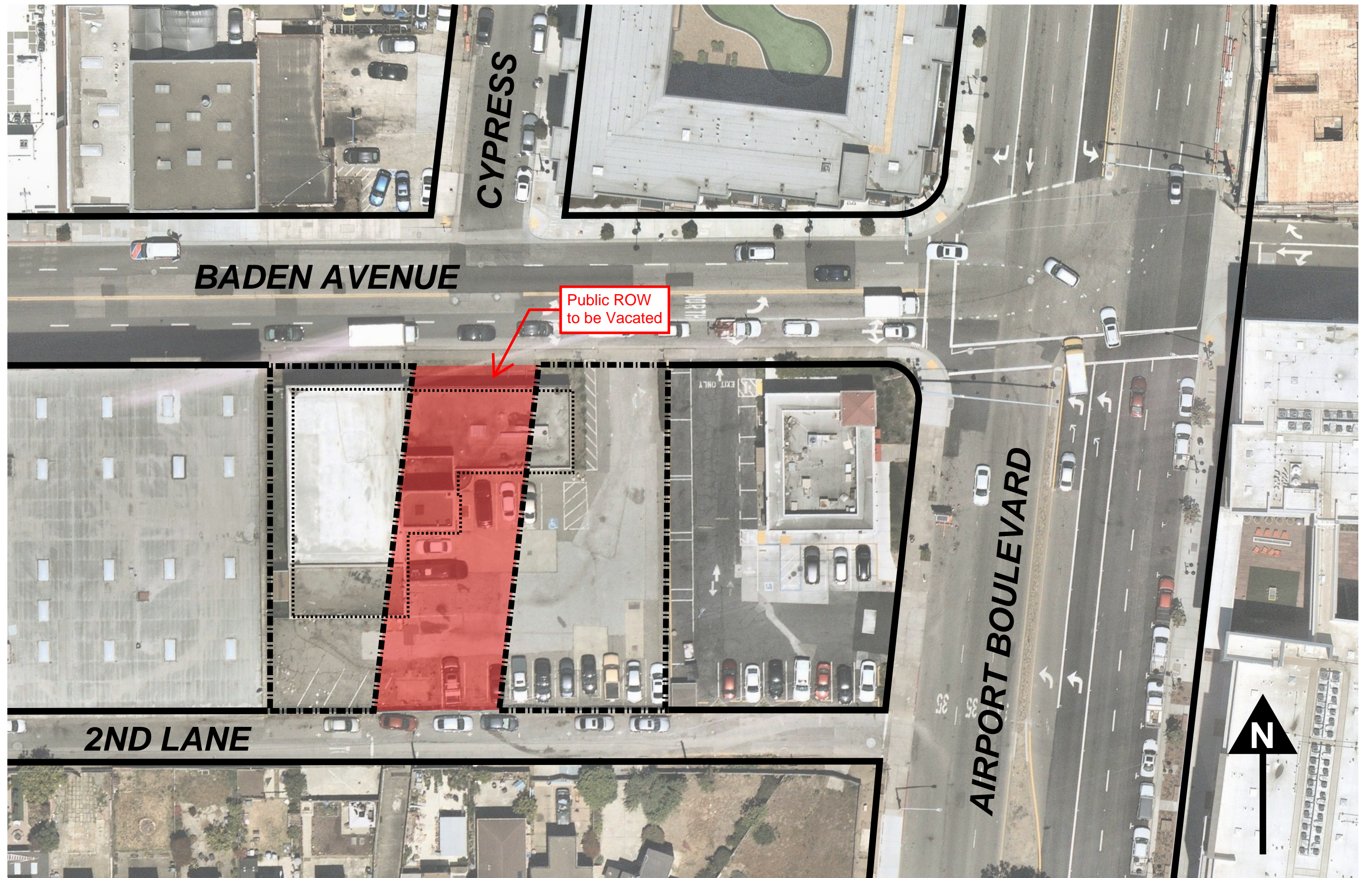
ATTACHMENT 1 - PARCEL FIGURES PROPOSED STREET VACATION