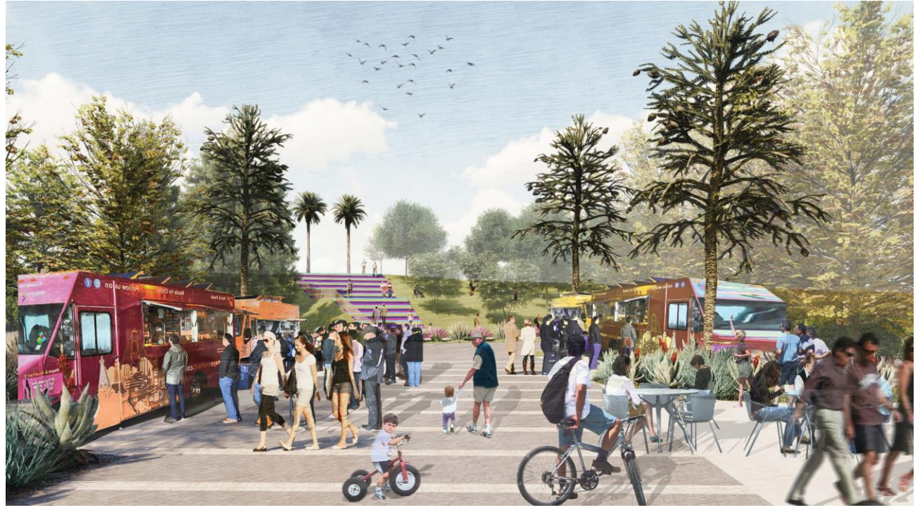
OAK AVE SHARED STREET AND GRAND STAIRS