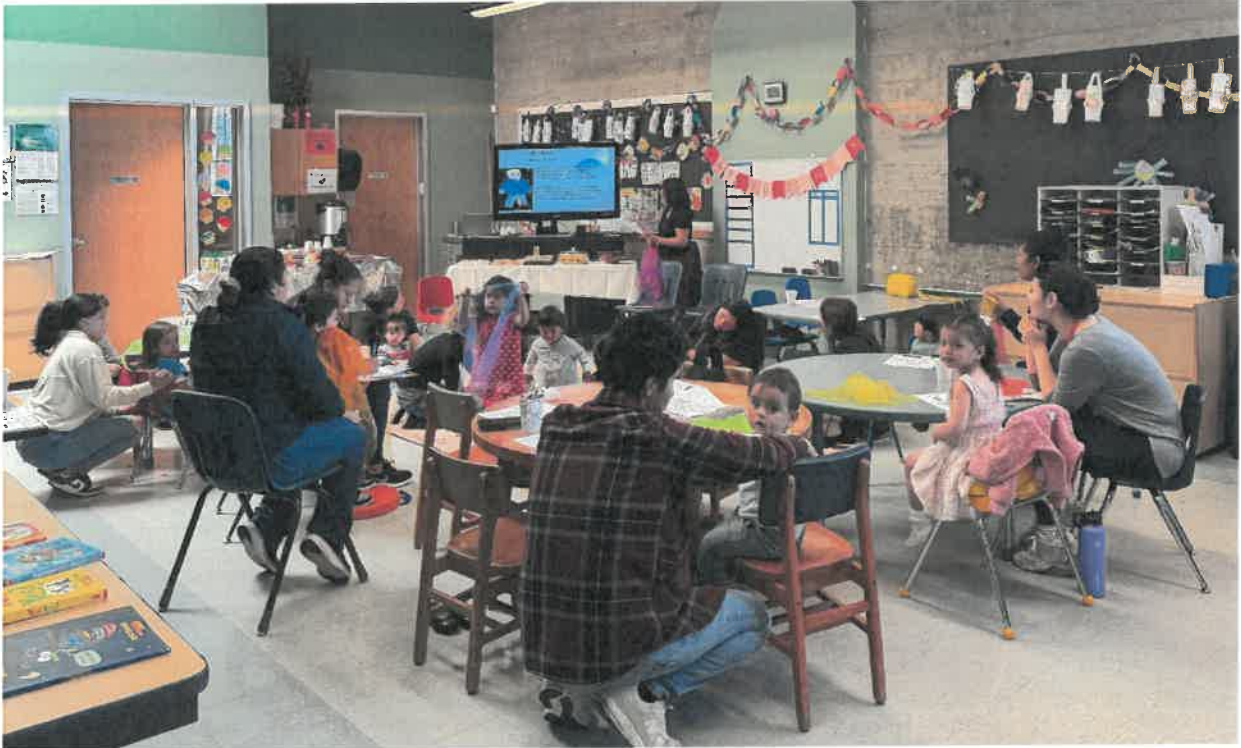
Storytime at Gene Mullin Community Learning Center

We had an exceptionally busy April in Family Literacy Services. In addition to our weekly programs, we supported six special events featuring Learning Wheels. The Family Literacy team made two preschool visits to Southwood and Hillside preschools and participated in two sessions of the Promise Champions evening program. We also joined the Town of Colma and the City of San Bruno for their Day of the Child celebrations.