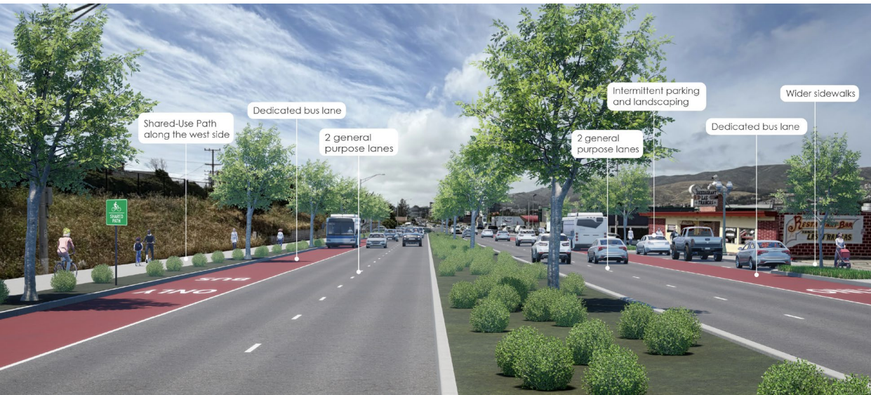
Alternative 2: Pedestrian & Bus Focus as the Preferred Option