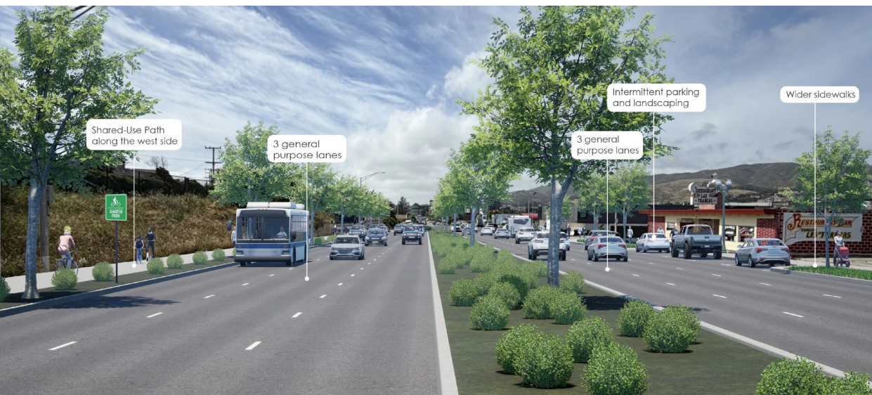
Alternative 1: Pedestrian Focus as the Secondary Option