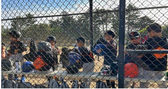
Junior Giants participants preparing for their game.

The Junior Giants program opened for registration on April 15 with families eager to enroll into a summer full of fun. Many players requested to play alongside their classmates, with teams ranging anywhere from nine to 17 players. Like previous years, the league decided on the following age group divisions: tee ball (ages 5-6), minors softball and baseball (ages 7-9), and majors softball and baseball (ages 10-13). South San Francisco had over 400 participants this season with a little over 100 volunteers.