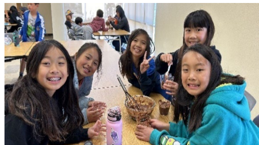
Teen campers enjoying a meal.

In partnership with the South San Francisco Unified School District, the Expanded Learning Opportunity Program (ELOP) was held for three weeks and offered at no cost to participants. This program had a STEAM focus while still maintaining the recreation philosophy of learning through play. Using the curriculum from three of our Specialty Camps, children participated in Hands on Camp, Art Exploration, Always Question, and Always Wonder.