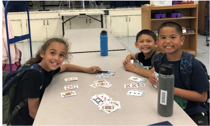
Children are provided a variety of activities to develop their skills.