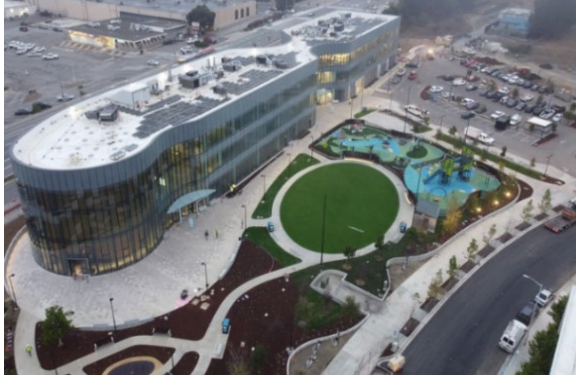
Library | Parks and Recreation Building

As the Department heads into the final five months of 2024, the Facility Rentals team has been extremely busy receiving inquiries and meeting with permit holders. The new rental spaces at the Library | Parks and Recreation Center (LPR) are extremely popular and people are excited to host their special events in the Banquet Hall and Social Hall. Permits are offered eleven months from the event date and the team is busy booking events in 2025.