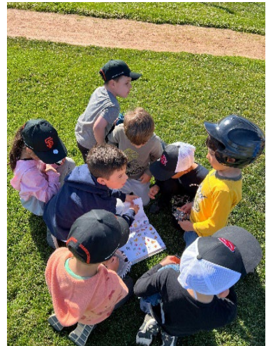
Junior Giants participants.