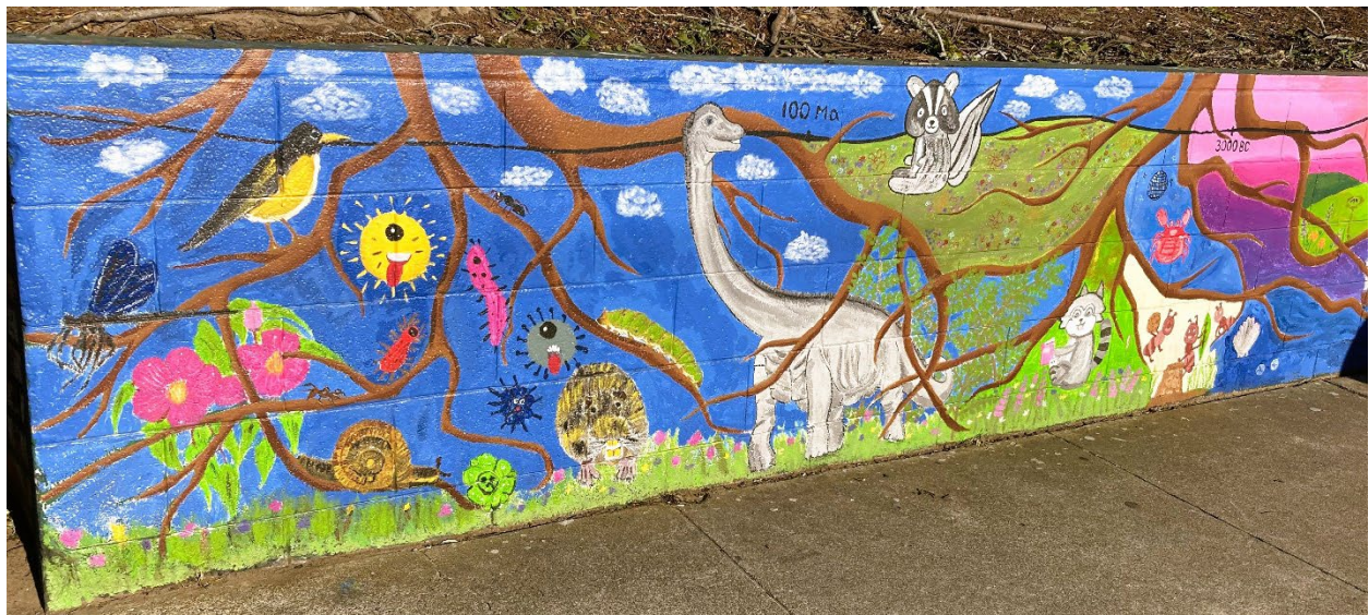
New mural located on Willow Avenue near Nora Drive

The Skyline College Community Mural Project (CMP) guides students through the process of creating a public mural, from research, and community engagement to the artistic techniques of design and execution. The brief Community Mural Project video highlights their journey.