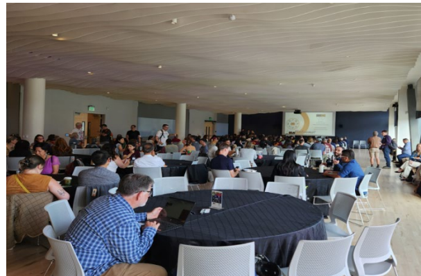
The Silicon Valley Bicycle Coalition hosted a very well attended event at LPR.