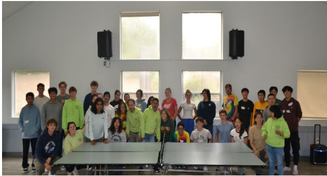
Full of Fun campers

Full of Fun Camp operated for three weeks this summer. There were over 50 high school volunteers providing one-on-one coaching to each camper during the three weeks of camp. Each day, volunteers partner with a camper and spend the day together doing activities, getting to know each other, forming friendships, and hopefully learning something new about themselves. This summer, campers participated in art projects, science experiments, cooking activities, sensory play, board games, ping pong, karaoke, dance