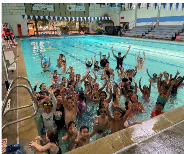
Campers enjoyed recreational swim.

Specialty Camps provide a topic focus for the week and include both internal and external instructors. This year's camps included Force Awakens, Build A Meal, Wizardry, Lego, and Sugar and Spice.