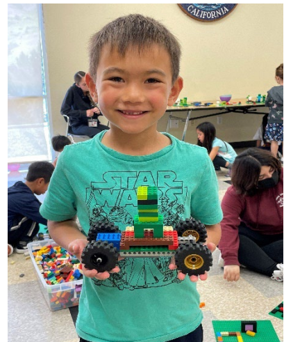
Campers had various field trips and participated in a variety of specialty camps.