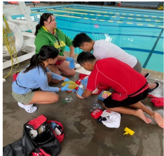
Figure 2: EAP scenario training. Passive victim removed from the water with CPR, AED, and BVM.