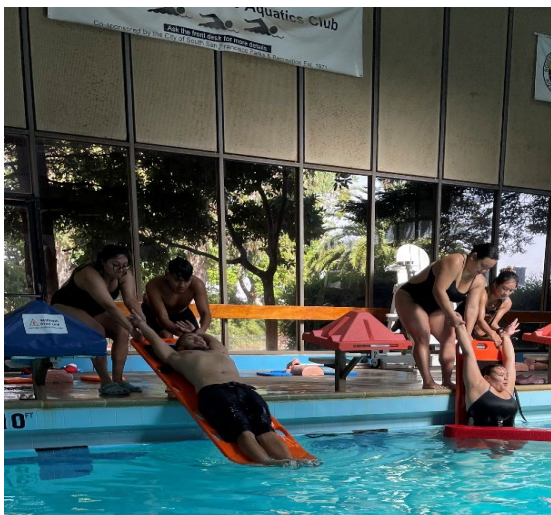
Figure 1: Extrication of a passive victim from deep water.

This summer, the lifeguards at Orange Pool updated their certifications to include the new American Red Cross 2024 update. Lifeguard training is ongoing, and certified staff are required to complete at least four hours of training per month. Training includes an in-depth review of skills such as CPR with a bag-valve-mask (BVM) and AED, rescuing and extracting a victim from the water (Figure 1), basic rescue skills, full emergency action plan scenarios (Figure 2), and staff discussions to ensure that every lifeguard is up to date to ensure smooth operations and public safety.