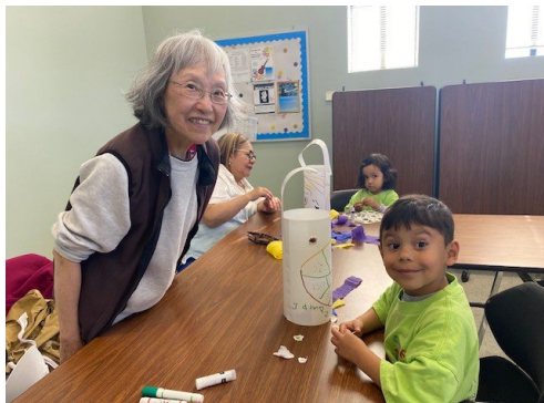
Preschoolers visited the Roberta Cerri Teglia Senior Center.

The last scheduled Grand-Friends program took place on Tuesday, August 20. The Siebecker preschoolers joined visited the Center to participate in craft projects with seniors. The senior participants had a great time talking with the preschoolers and helping them with the activity. The preschoolers had so much fun that when they finished with the craft, they were not ready to leave yet, so they walked down to the Adult Daycare Program to show Daycare participants their projects. All the participants, both preschoolers and seniors, look forward to the next Grand-Friends event.