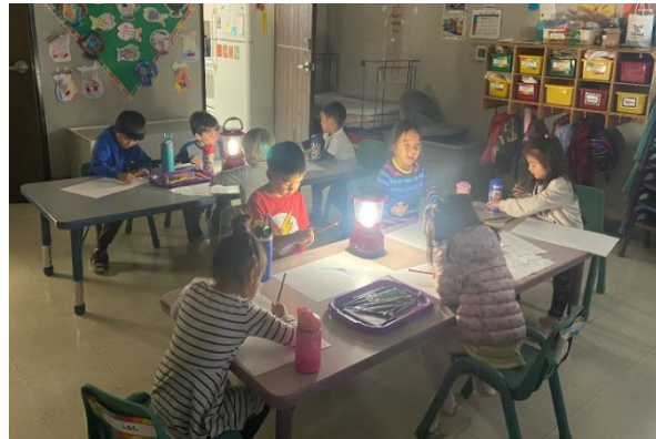
Preschoolers during their camping themed day.