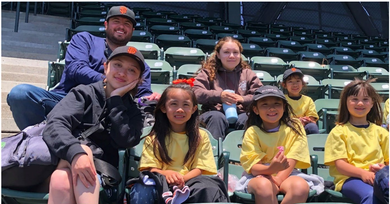
Summer 2024 camps were a success and highly enjoyed by recreation staff and all campers!