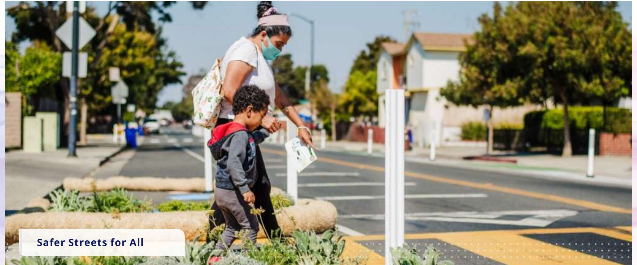
Safer Streets for All

Vision Zero Action Plan (TR2405) March 11, 2026, Engineering Division