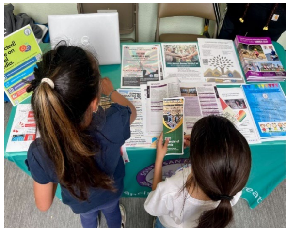
The LPR Community Resource team represented Parks and Recreation at two different events.