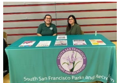
Recreation staff participated in the El Camino High School Job & College Fair.