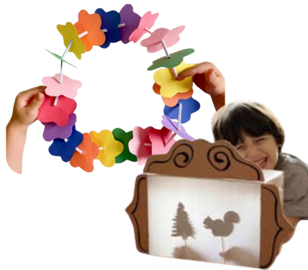
Fun Crafts for all ages