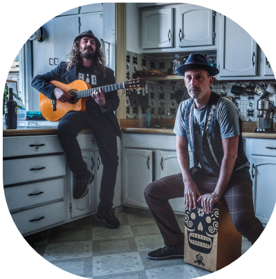
Dos Bandoleros, Bay Area based Spanish & Latin music duo

Kick off the 2026 Summer Learning Challenge with a family friendly musical performance by Dos Bandoleros. Learn about all the special events happening this summer, see a live 3D printing demo, make fun crafts and much more.