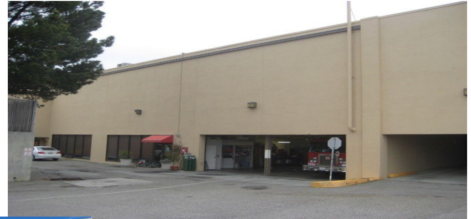
Moved to 33 Arroyo, 1981