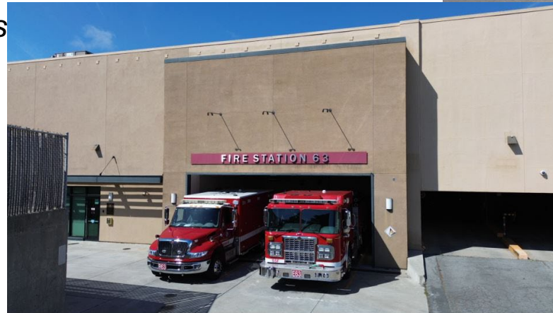
Remodeled Station 63, 2010