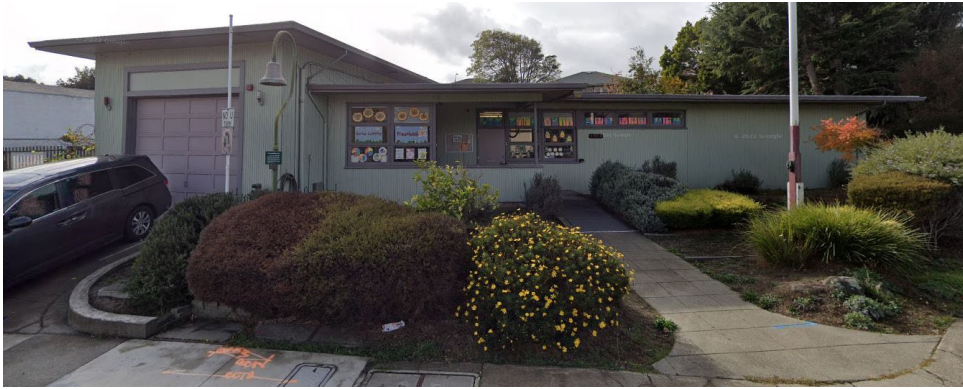
1165 El Camino Real, 1950's