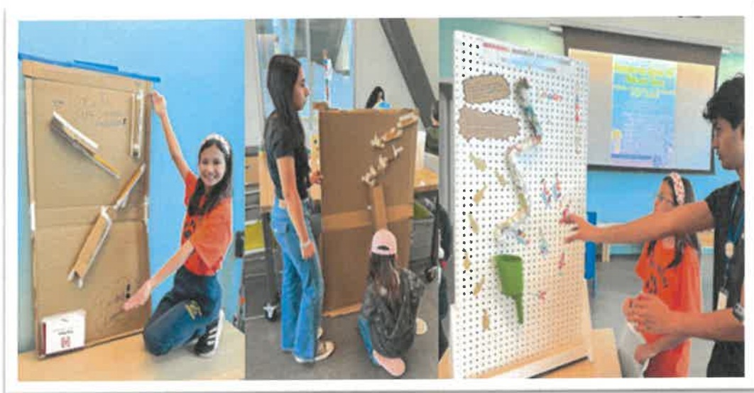
Rube Goldberg Machine