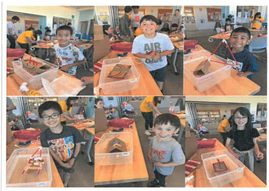
Design and Build a Boat