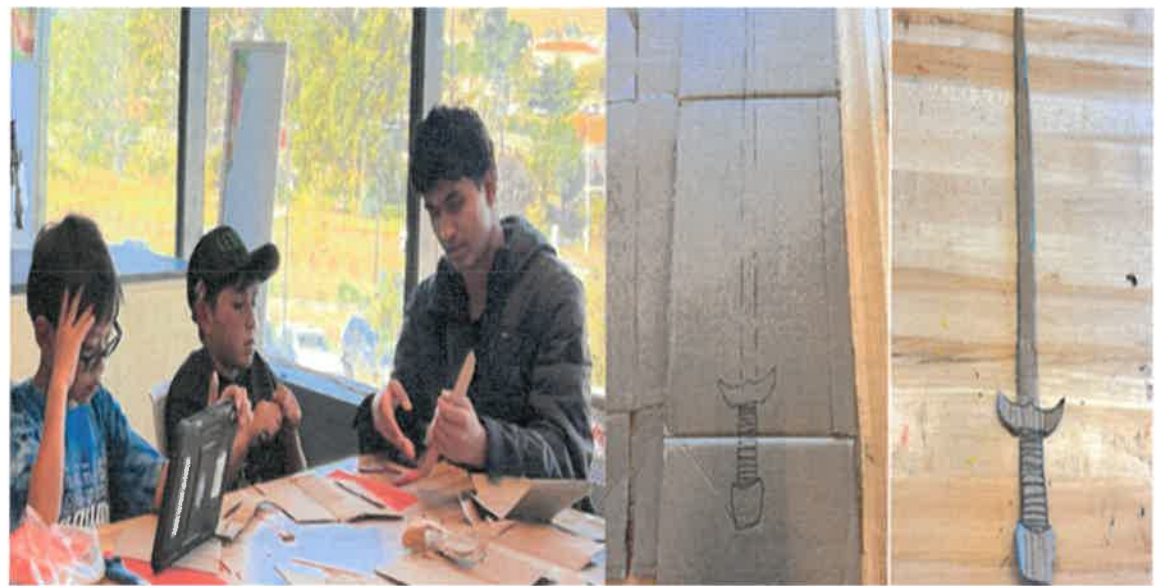
Construct a Cardboard Sword