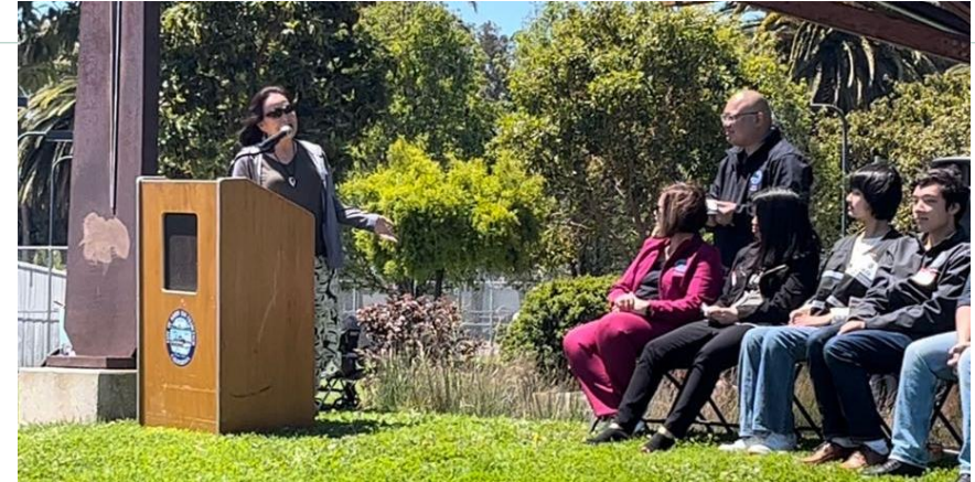
Asian American Pacific Islander Month