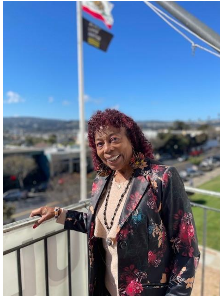
Black History Month