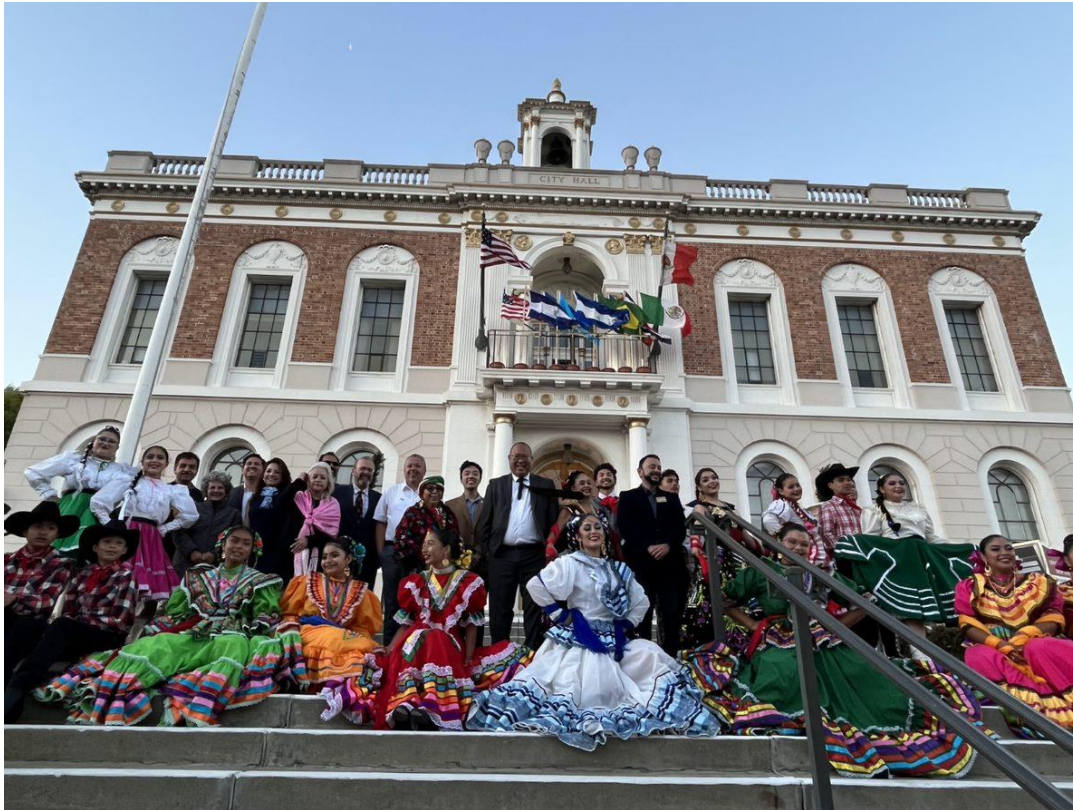
Hispanic/Latinx Heritage Month