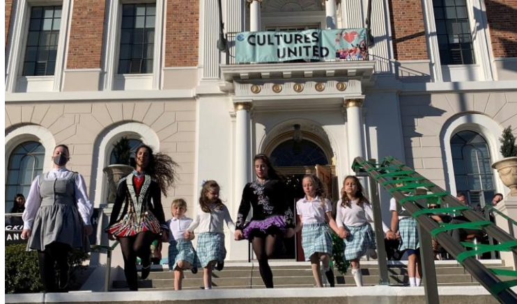
Irish-American Heritage Month