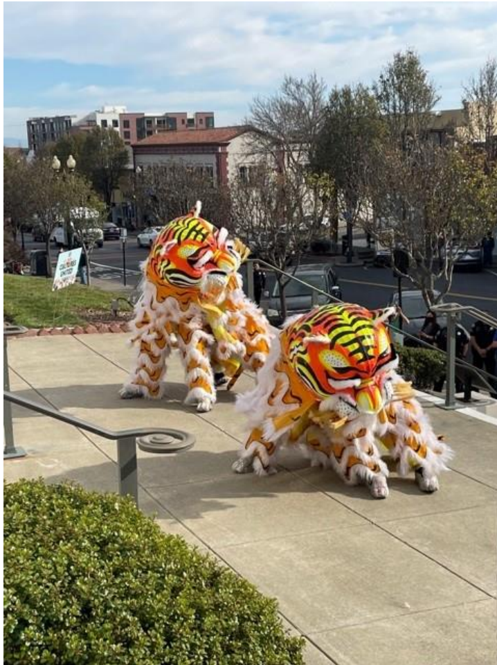
Lunar New Year