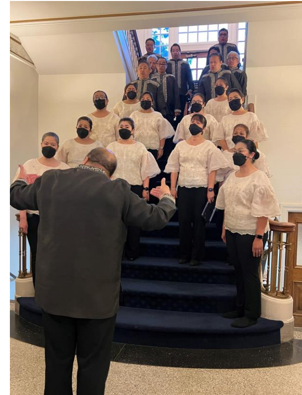
Filipino American History Month